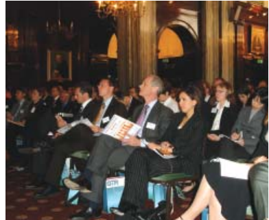
Iran Risk Business Briefing delegates 2006