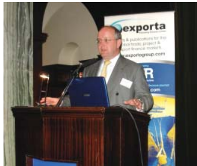
Iran Risk Business Briefing 2006 Speaker Presentation